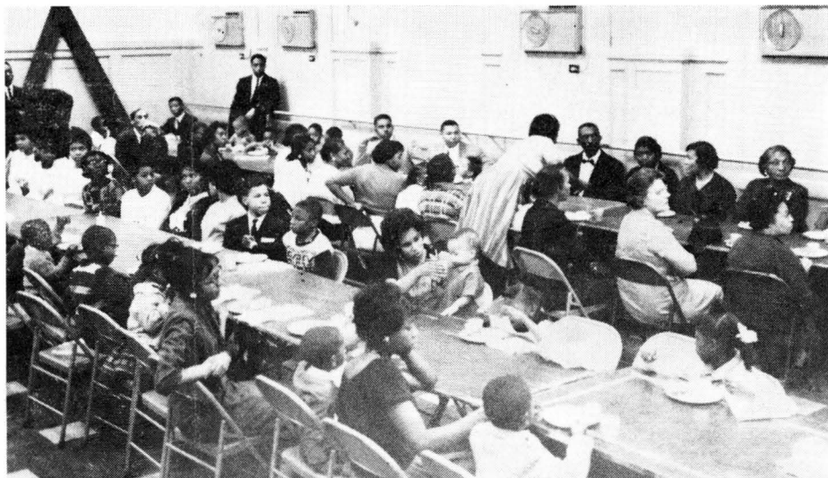
On Sunday, December 23rd, an old-fashioned family social was held for the colored brethren of Chicago. A treat and delight for all: dancing, food, singing, basketball, and games.

The habit of going to the bottom of things usually lands a man on top.