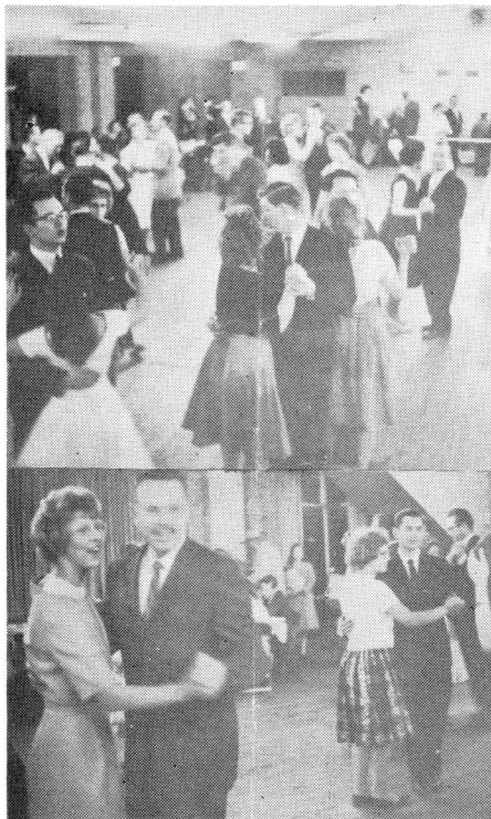
Chicago-LaGrange Social held December 16 at Wozniak's Hall.

IF YOU WANT TO STAY YOUNG, "TRY DANCING"!